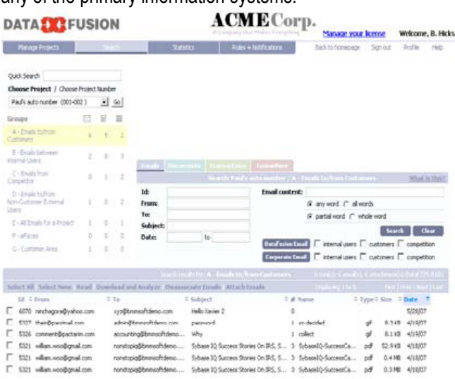
The BMMsoft Server GUI offers integrated searching and cross-analysis across both structured and unstructured data

The BMMsoft Server is a powerful, cost-effective solution that captures, searches and analyzes all enterprise data. In short, BMMsoft Server creates a real-time, useable copy of all electronic data in a highly scalable Universal Data Warehouse (.UDW.), where SQL transactions and unstructured files can be economically stored, searched and analyzed without burdening any of the primary information systems.